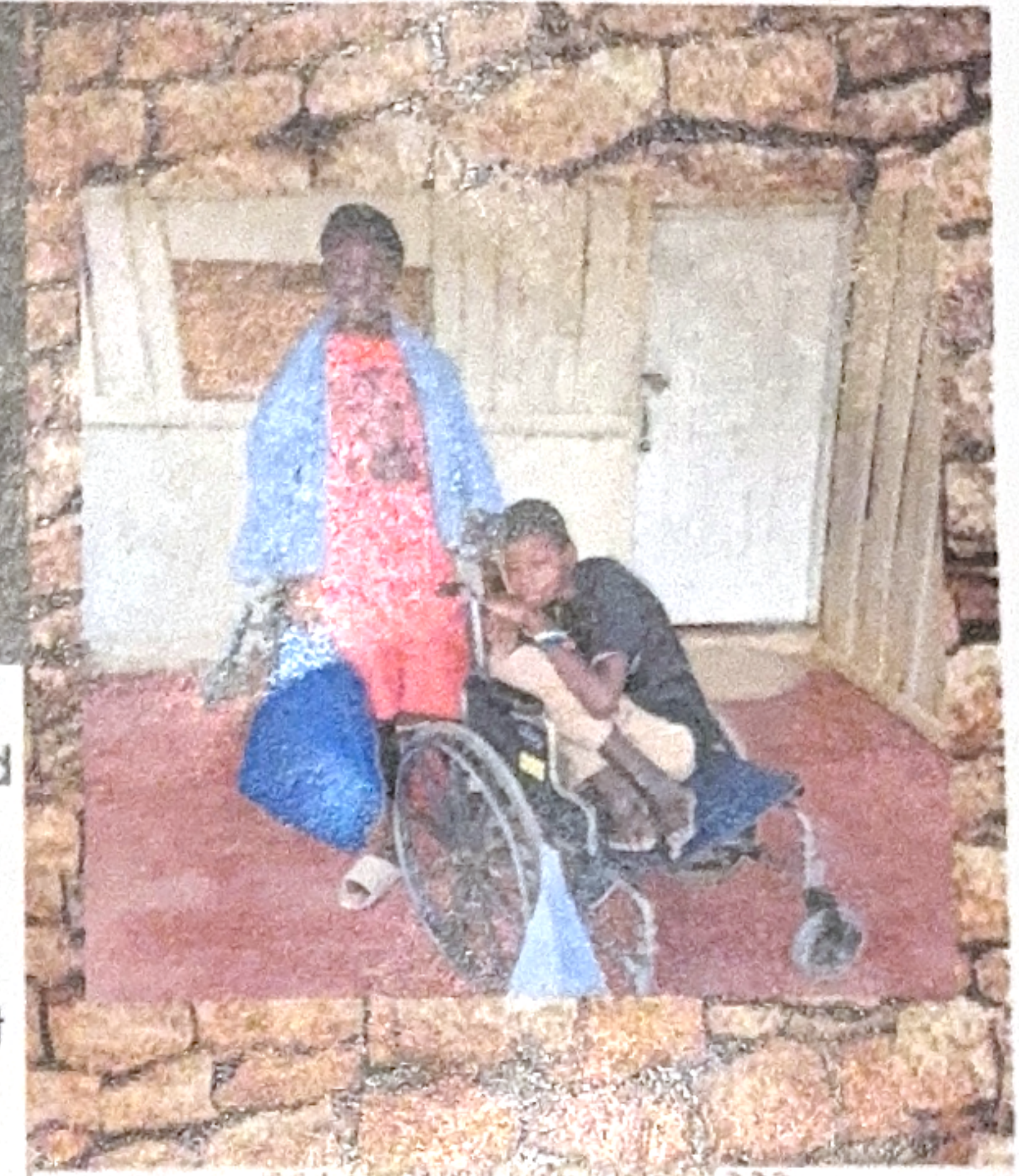
Prayer Requests >>>