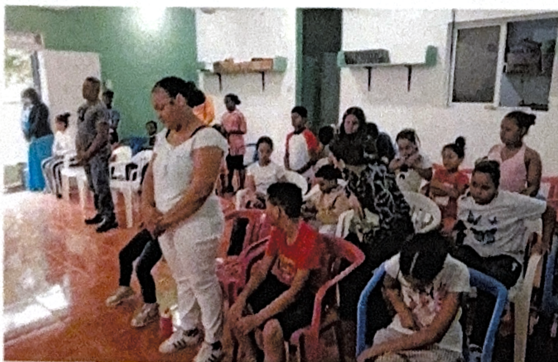
Adult and Children at Iglesia Bautista De La Luz Del Evangelio

We are also grateful for the good Samaritan's Purse ministry. We received 9 boxes full of gifts for the children. Many of these children do not receive gifts for Christmas, but God always arrives on time and we are fortunate for so many people being used by the Lord to give and see a smile on the children's faces. The most valuable gift is to see these boys and girls receive the story of Christ and be saved by Him!